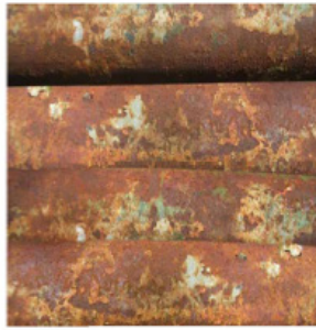
Uniform corrosion [2]