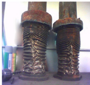
Expansion joints on a steam line that have been destroyed by water hammer [7]