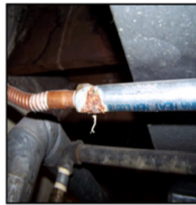
Electrochemical corrosion [5]